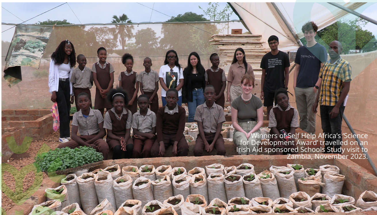
Winners of Self Help Africa's 'Science for Development Award' travelled on an Irish Aid sponsored Schools Study visit to Zambia, November 2023.