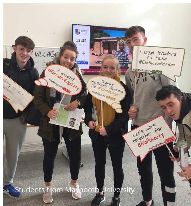
Students from Maynooth University

Should you be interested in learning more please contact us at: schools@selfhelpafrica.org or leave a message at (01) 6778880 and we will respond to your inquiry.