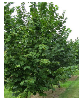
Hazel: an Irish tree