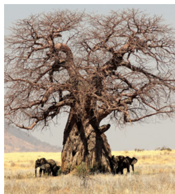
Baobab: an African tree